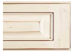
Weathered, Distressed & Antiqued