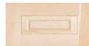
5R - 5 Piece Raised