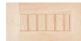
5B - 5 Piece Beaded