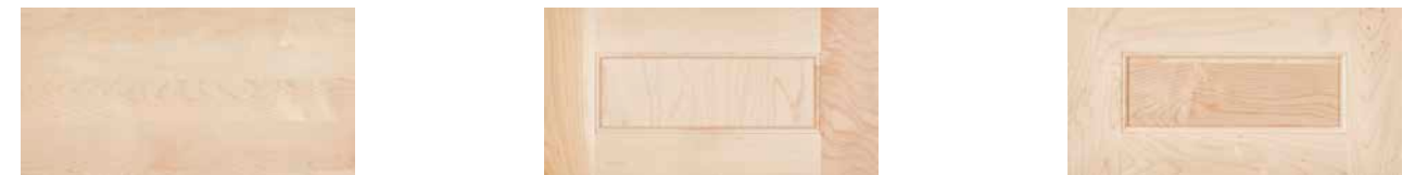
S - Slab