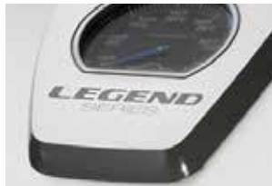
ACCU-PROBE™ Temperature Gauge