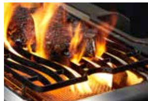
Infrared SIZZLE ZONE™ Side Burner (LD485RSIB)