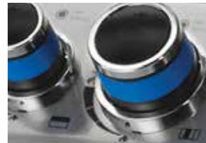
Ergonomic Control Knobs