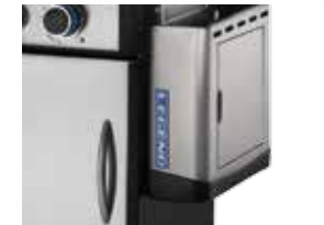
Folding Side Shelves (410 and 325 models)