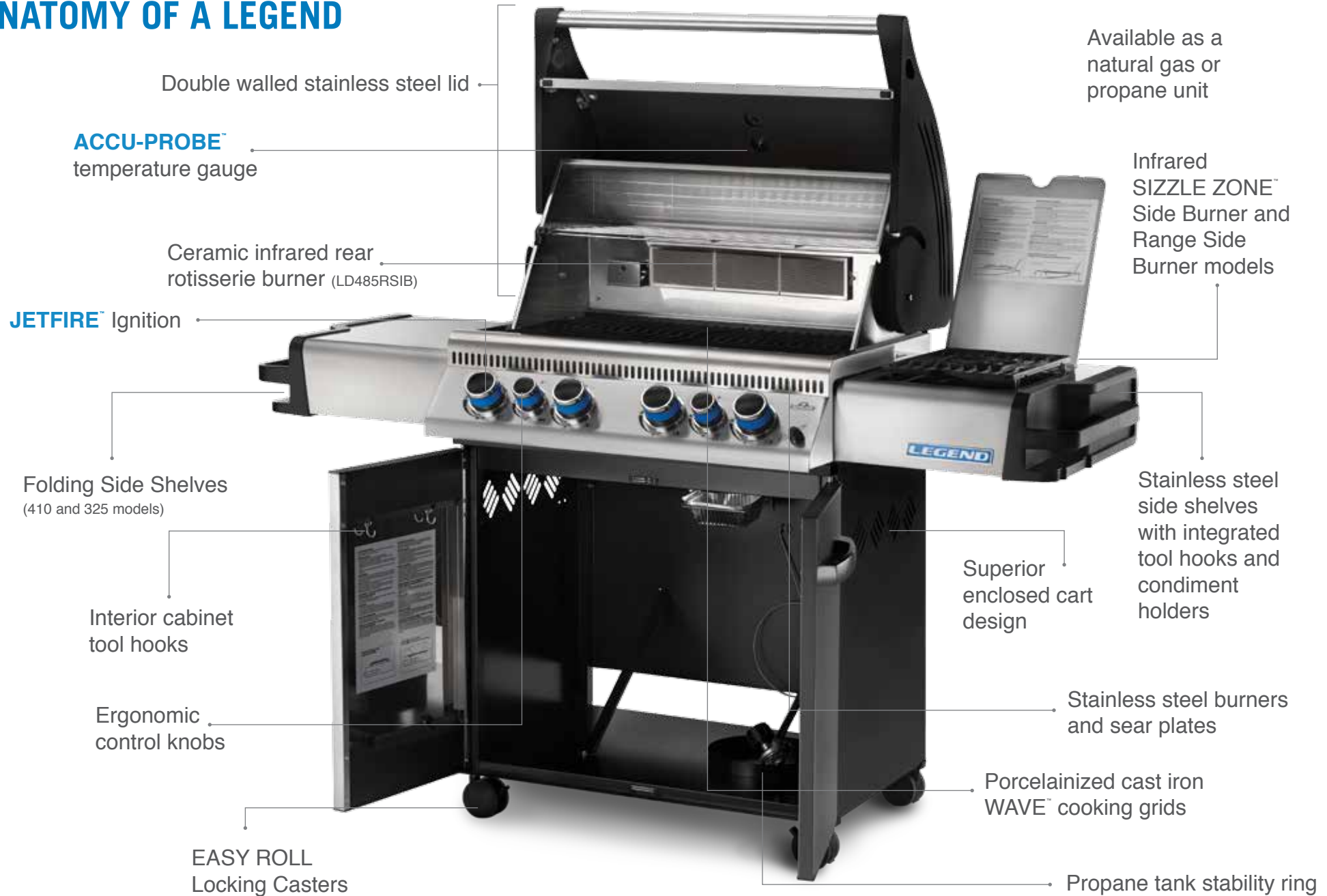
Model shown: LD485RSIB