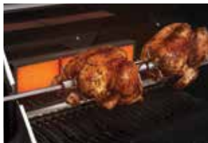
Ceramic Infrared Rear Burner (LD485RSIB)