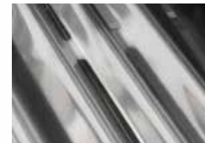
Stainless Steel Sear Plates