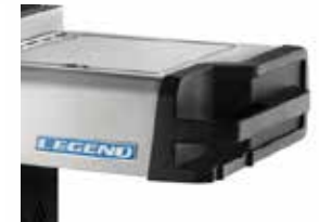
Stainless Steel Side Shelves with Integrated Tool Hooks and Condiment Holders (LD325SB, LD410SB do not feature condiment holders)