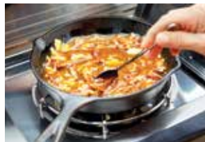
Range Side Burner (excl. LD485RSIB)